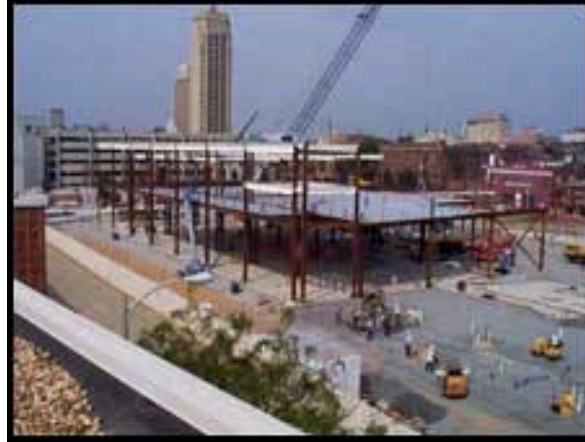
Figure 1.1 Richmond Center