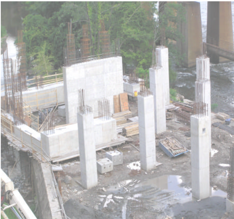
Fig 1.2 Riverside Village Residential Tower over Micropiles

5.6 REPORTS. Special inspector shall leave all daily reports jobsite office and submit earthwork completion report to code official with seal and signature of Geotechnical Engineer of Record.